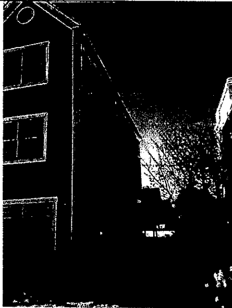
RIGHT SIDE VIEW FROM FRONT

If submitting more photographs than will fit on the preceding page, affix the additional photographs below. Identify all photographs with: date taken; "Front View" and "Rear View"; and, if required, "Right Side View" and "Left Side View." When applicable, photographs must show the foundation with representative examples of the flood openings or vents, as indicated in Section A8.